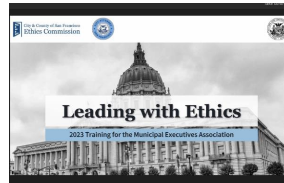
Screenshot of an MEA training.